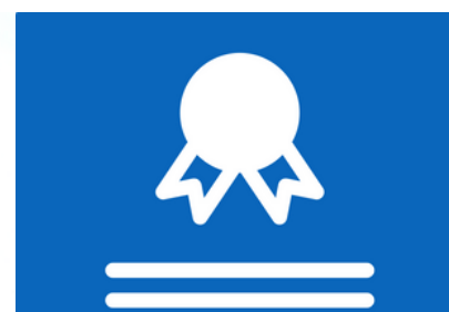
Calibration Certificate Service